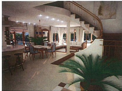
Pristine Bay Interior on the 11th hole.

The Real Estate Channel was on the scene as well, and we liked what we saw. Featuring a gorgeous 400-acre site on the tropical island of Roatan, the Dyes' soon-to-be-opened Black Pearl Golf Course has all the makings of another "to-Dye-for" layout. Located 35 miles off the coast of Honduras next to the world's second largest barrier reef, Pristine Bay also is actively building a 120-room five-star boutique hotel in a joint venture with Houston-based Lancaster Group and private beach club for residents.